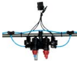
MULTI-SPRAY DIRECT CONTROL

Using GPS the Smart Nozzle System allows the control of each individual nozzle on the spray line. Each nozzle is a section. This individual nozzle control opens up new dimensions and precision in crop protection.